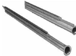
Code 50A - Burner Only