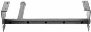
Code 53 - Manifold (less orifices)