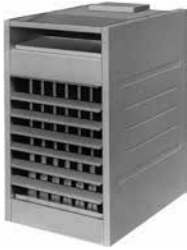
Model B, Blower-Type, Gravity Vent