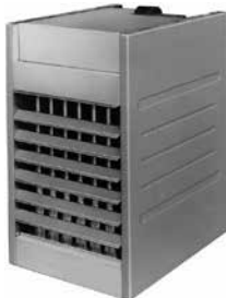
*Model BE, Blower- Type, Power Vent