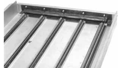
Code 51 - Carryover Assembly